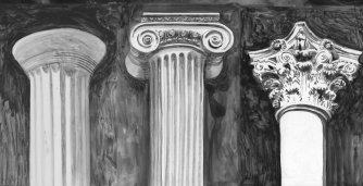
Boring Frilly Very Frilly

Welcome to the ancient ruins of Washington DC, Earth! Enjoy fine dining and unparalleled shopping and flirting opportunities while exploring one of the great mysteries of the Known Universe.